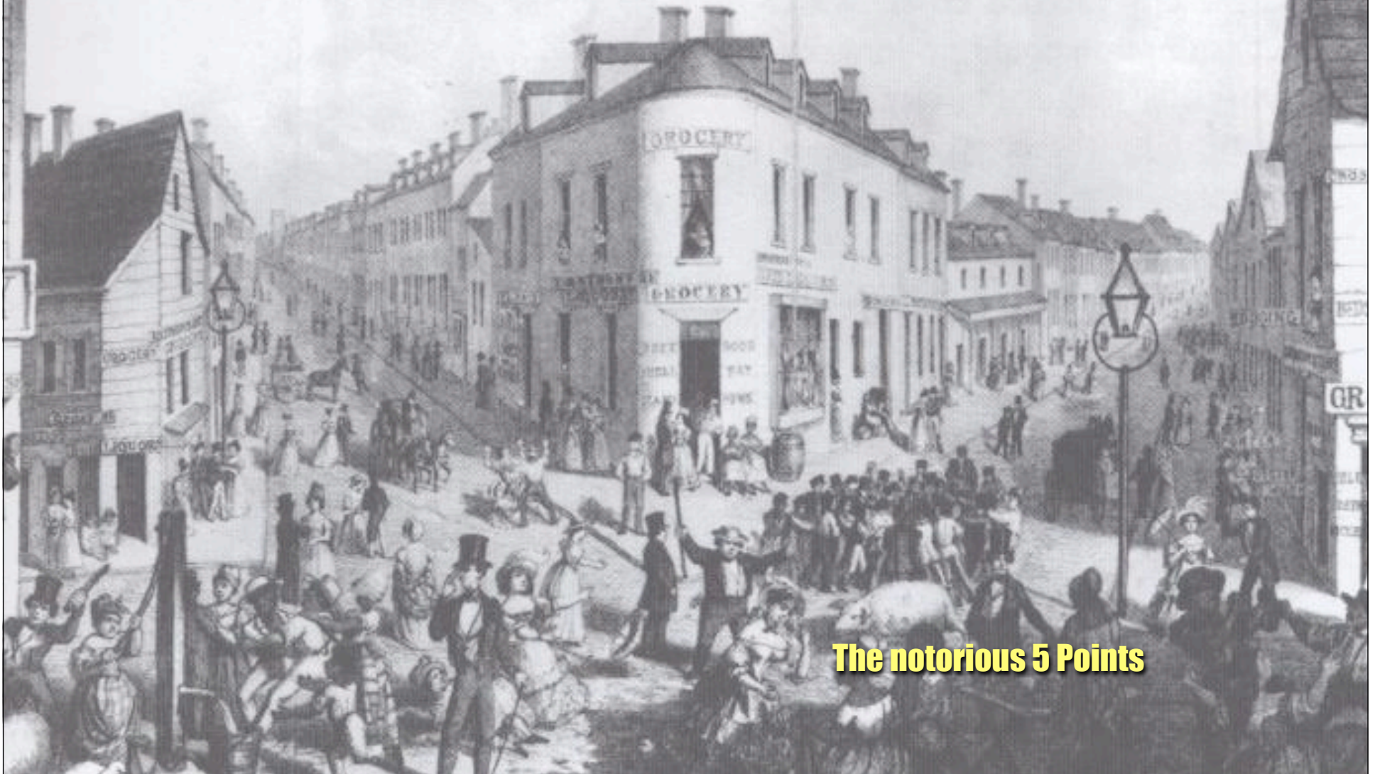
The notorious 5 Points

The growth of gangs surged at the same time that the first neurosurgical procedures were recorded.