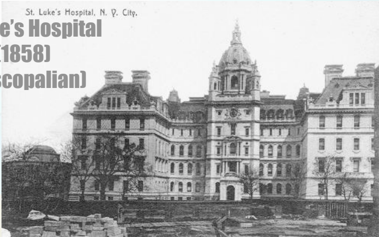
St. Luke's Hospital (1858) (Episcopalian)